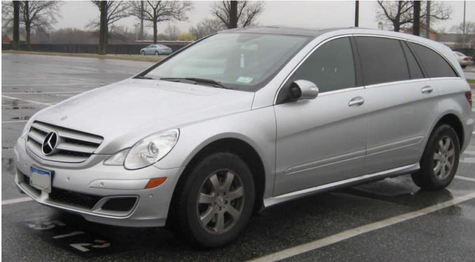
Figure 3. Mercedes-Benz R-Class

Cars are not the only things we tend to classify. We tend to classify pretty well everything that we happen across, including people. In our minds, we create certain categories and when we meet people with who have certain attributes we then we try to fit them into these categories, though sometimes it has the same result as trying to fit a square peg into a round hole. Captain Holly Graf was a commander of the Japan-based guided missile cruiser U.S.S. Cowpens (Thompson 2010). She had all attributes to place her in the commander category: she was very knowledgeable, experienced, outspoken, and decisive, all necessary attributes when commanding a large navy ship. Because of these attributes, she was promoted into the rank of commander. Unfortunately, people who classified her as a commander type and then promoted her to the position ignored one other important attribute required by leaders: people skills. It turns out Commander Graf had none. After numerous complaints regarding her handling of subordinates and other ranking officers, she was removed from her position as a captain of a billion-dollar warship for "cruelty and maltreatment" of her 400-member crew. According to the Navy inspector general's report and the accounts of officers who served under her command, Holly Graf was the closest thing the U.S. Navy had to a female Captain Bligh. Inspector general's report stated that she repeatedly verbally abused and assaulted her crew.