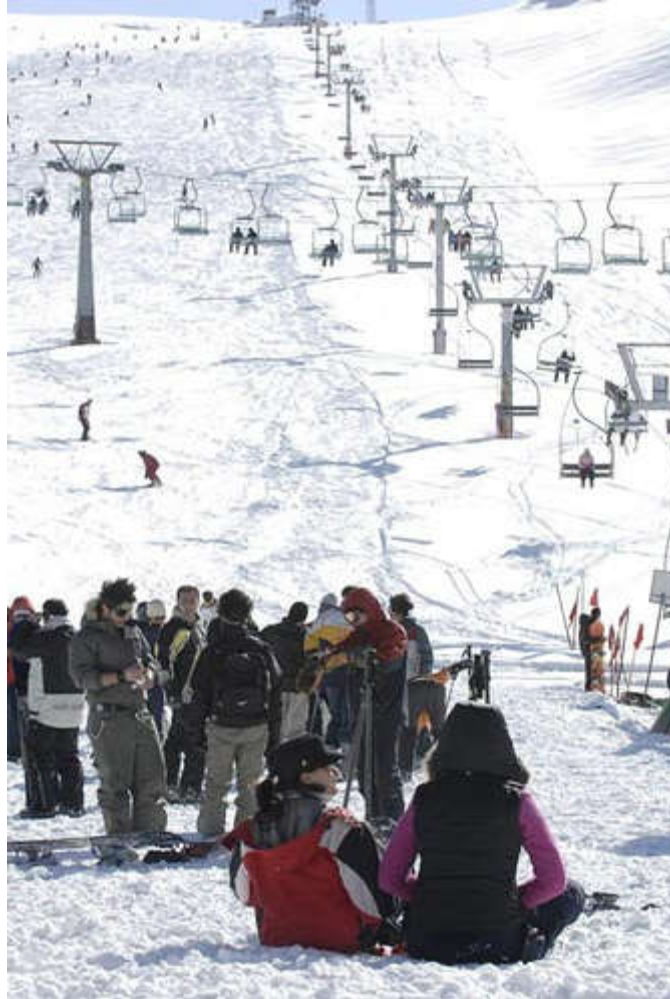
Figure 2. Where is this ski resort?

We like to organize information so it is easy to understand: we create classifications, hierarchies, assign attributes to almost everything we encounter. In most cases this strategy works very well and is an efficient analytical technique. The problem occurs if we incorrectly categorize information and judgments that are based not on the real properties of the thing (object, person or a process), but rather on the properties of the category or group to which we have assigned it. This is the mistake we made when we passed judgment on the Iranian ski report.