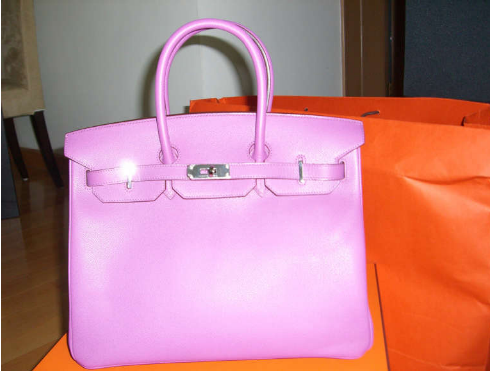
Figure 1. Birkin Bag

How does Hermes determine the price for their bag? Normally, we determine a price for a product by comparing it to similar products. For example, while at a farmer's market you see that most producers charge $1 for a pound apples. As you wander amongst the many fruit sellers, you discover one stall that is selling what appear to be higher quality apples for $2 per pound. You also know that apples normally range in prices from $1 to $2 depending on the type, quality, and season. Now you can compare the $1 and $2 apples and decide whether the difference in quality, type, etc. makes it worthwhile to pay an extra $1. In your analysis, you leave out supply and demand, net present value or expected value, you just use a mental shortcut by comparing the prices of apples with a reference point. This is a simple and effective analytical process. In the case of Birkin bags, the situation is not so simple. There are no readily available reference points to help determine what the cost should be for a Birken bag. Therefore, Hermes is free to ask for any price when they first introduce the bag and at that point, the price becomes the anchor that will be used to determine the prices of all Birkins bags. People commonly rely on anchors, or one particular piece of information or reference point to make decisions. If this anchor is set up incorrectly or arbitrarily, it may lead to wrong decisions. This effect is called the anchoring heuristic (Tversky and Kahneman 1974).